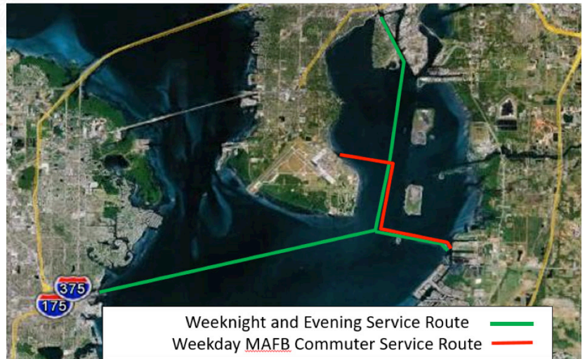
Figure 2 - Ferry Operating Routes

Weekday service would start with commuter service between South Hillsborough County and MacDill Air Force Base. The MacDill commuter route would take 10 million miles of car trips off local roads and ease the commute of thousands of men and women who work at MacDill to protect our nation. And it would lay the foundation for future commuter service between St. Petersburg, Westshore, downtown Tampa and rapidly growing South Hillsborough County.